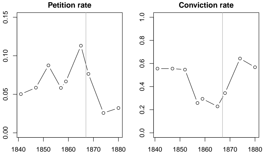
Figure 3: Petition rate and conviction rates, 1840-1880

NOTE: The left panel depicts the proportion of election contests (those with more candidates than seats) that resulted in petition trials for each general election between 1840 and 1880. The right panel depicts the proportion of petitioned MPs who were convicted.